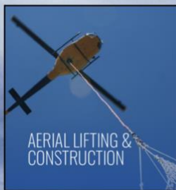
AERIAL LIFTING & CONSTRUCTION