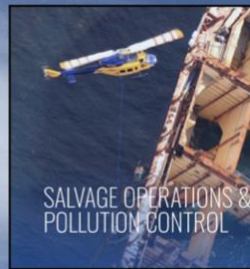
SALVAGE OPERATIONS & POLLUTION CONTROL